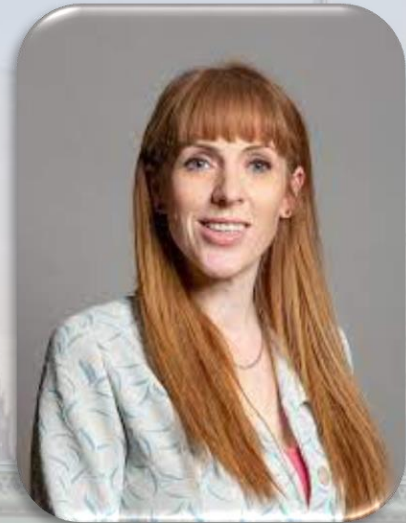
Angela Rayner MHCLG