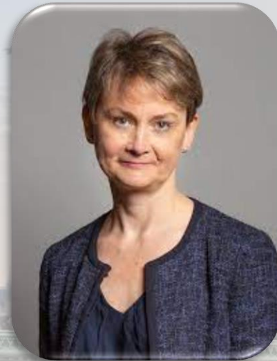
Yvette Cooper Home Office