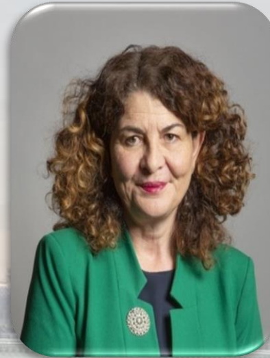
Dame Diana Johnson Police and Fire